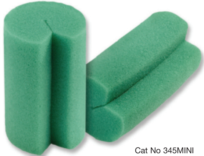
Cat No 345MINI Unit of issue - 100

The Mini Endozime Sponge® is contoured to safely fit around small flexible and rigid scopes and tubular medical instruments with outer diameters of 2 to 6 mm. Providing a quicker and more thorough pre-cleaning.